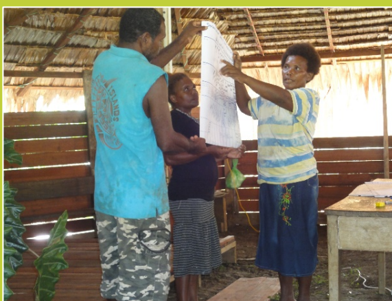
Presentation of a created seasonal calendar