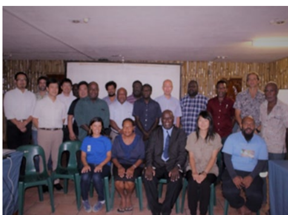
Group photo of the First Forest-Sector Technical Working Group

The Solomon Islands Forest-Sector Technical Working Group was established in response to calls from the MOFR and the Japanese Experts of the Project. The members of the Working Group are the MOFR, Solomon Islands National University, donors and NGOs that operate in the forest-sector in the Solomon Islands, including the members of their projects. At the first meeting held in March 2018, discussions were had about the role of the Technical Working Group and the frequency of its meetings and about expanding membership in the future; a mailing list was started to promote communication among members. It was also decided that the Project would serve as the secretariat for the subsequent two years to operate the Technical Working Group in cooperation with the MOFR.