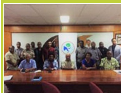
PNG Forest Authority (PNGFA) courtesy call