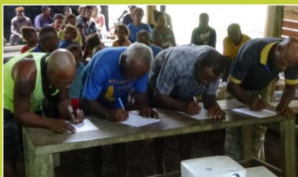
Community signing a Memorandum of Understanding