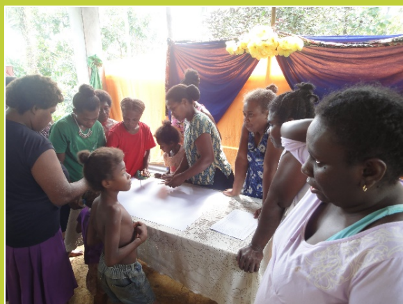
Mapping work by a woman's group

During this period, based on information collected together with MOFR staff, the Project narrowed down multiple Pilot Site candidates from those recommended by the MOFR. Six communities with a high probability of success were selected and then visited by the Project staff. At that time, the Project carried out awareness-raising activities on SFRM, gathered information using participatory methods and tools, and created community profiles (basic information) for the communities with the aim of strengthening the capacity of MOFR staff to support them.