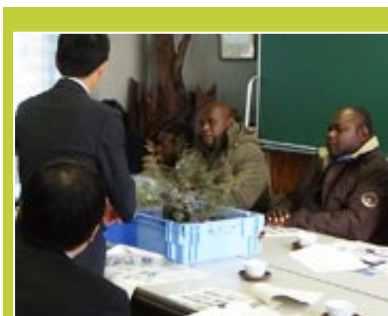
Counterpart Training in Japan (Gifu Prefecture Tree Breeding Center)

A study tour was conducted to observe a Japan International Cooperation Agency (JICA) Technical Cooperation Project underway in Papua New Guinea and to learn precedent cases of Sustainable Forest Resource Management (SFRM) and environmental conservation in the Pacific region. The Ministry of Forest & Research (MOFR) witnessed a step-by-step approach from a neighboring country and reaffirmed that the development of laws and strengthening of management capacity and improving the management system for deforestation was an urgent issue.