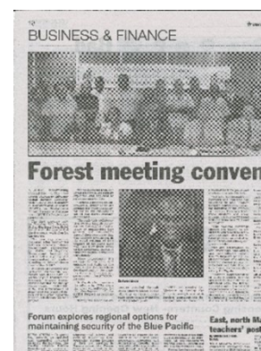
Newspaper article on the First JCC Meeting

The First Joint Coordination Committee (JCC) Meeting was held in January 2018. In addition, the Five-Year Project Plan (Plan of Operation) and the Annual Working Plan for 2018 had already been approved by the JCC members. The Project is to be managed in cooperation with Project members from the Solomon Islands and Japan.