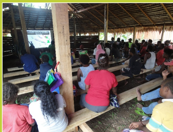
Educational activities related to Sustainable Forest Resource Management