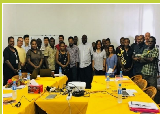
Group photo of the Second Forest-Sector Technical Working Group

The MOFR, the implementing agency of the Project, formulates a Corporate Plan (Ministry of Forest & Research Medium-Term Plan) as a business plan every four years. Since the current Corporate Plan 2015-2018 will end in 2018, after reviewing this plan and analyzing its issues, the Project is supporting the formulation of the next plan, the Corporate Plan 2019-2022, for the realization of more SFRM.