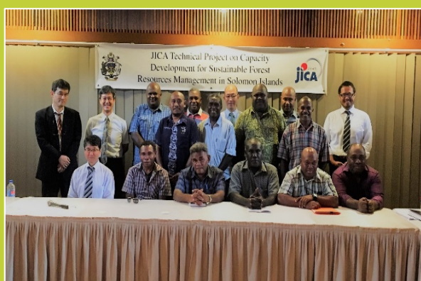
Group photo of the Second JCC