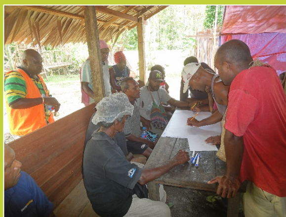
Mapping work by a woman's group